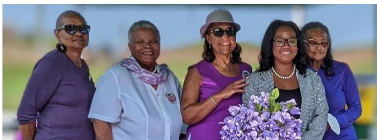
National Association of Colored Women's Clubs