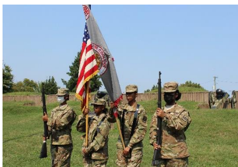
Calvin Coolidge H.S. JROTC