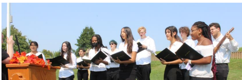
Montgomery Blair H.S. Chamber Choir