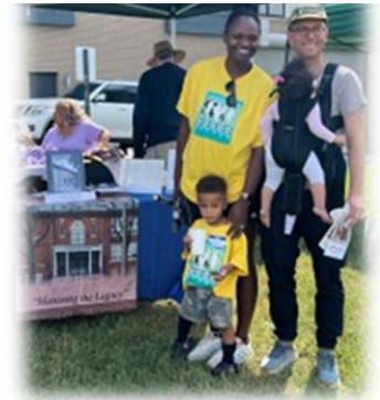
A Local Family enjoys the day's activities