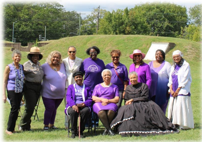
NACWC Officers & Members